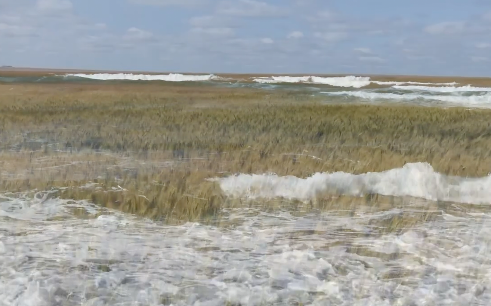
Image credit, Louisa Ferguson, Chimera (2020), Video still, used with permission of the artist